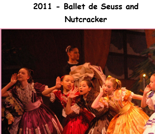
Academy students performing in 2011 - Ballet de Seuss and Nutcracker

Thank you for making your payments on time.