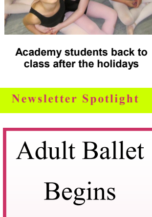
Academy students back to class after the holidays

Calling all students!!! The regular class schedule resumes Tuesday, January 3rd. After a two week break, we are ready to begin getting back into shape and prepare for our spring semester and end of the year Academy performance, "Etudes & Excerpts" on Saturday, June 2nd.